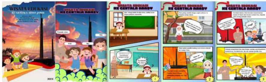
Figure 2. Link to digital comic ( https://online.fliphtml5.com/rddrw/atph/ )

The development stage in the 4D development model is the stage where comic media is developed or created based on designs that have been prepared in the previous stage. At this stage, the process of preparing a storyline that is adapted to Gentala Arasy's ethnomathematics concept begins. The final step in this development stage is creating a comic design. In making comic media, such as digital comic learning media, designing comic media scripts needs to be beautified to make them more interesting to read, of course adjusting existing colours and images and carrying out quality tests by media experts and material experts. This is done so that ethnomathematics-based digital comic media can function as expected. At this stage, trials were also carried out on students to see user interactions and experiences in comic learning media. If problems or errors are found, corrections will be made before the implementation phase begins.