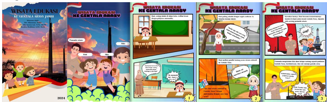
Figure 2. Link to digital comic ( https://online.fliphtml5.com/rddrw/atph/ )

The development stage in the 4D development model is the stage where comic media is developed or created based on designs that have been prepared in the previous stage. At this stage, the process of preparing a storyline that is adapted to Gentala Arasy's ethnomathematics concept begins. The final step in this development stage is creating a comic design. In making comic media, such as digital comic learning media, designing comic media scripts needs to be beautified to make them more interesting to read, of course adjusting existing colours and images and carrying out quality tests by media experts and material experts. This is done so that ethnomathematics-based digital comic media can function as expected. At this stage, trials were also carried out on students to see user interactions and experiences in comic learning media. If problems or errors are found, corrections will be made before the implementation phase begins.